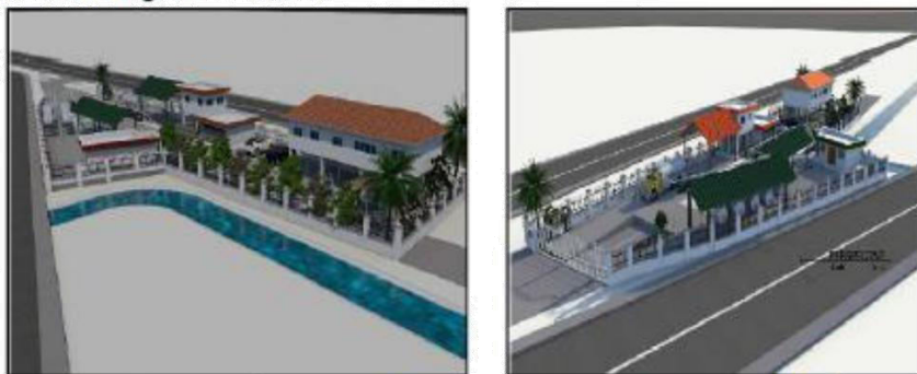
Figure 3-2. Perspective of the Proposed Sewage Treatment Plant

The perspective of the proposed sewage treatment plant provided by the client is shown in Figure 3-2 below.