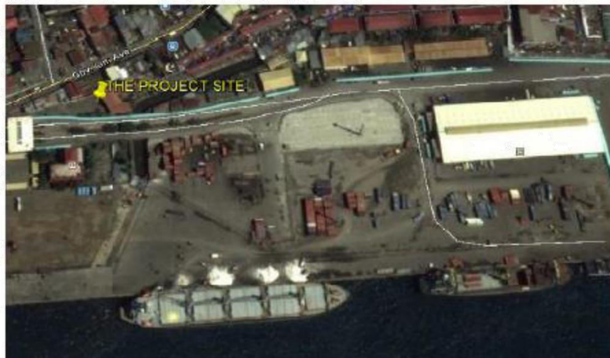
Figure 3-1. Project Site Location from Google Earth

The proposed site, located at Magay St., Barangay Zone IV, Zamboanga City, is situated inside the compound of Material Recovery Facility near the Philippine Ports Authority (PPA) and main public market. The proposed site is currently surrounded by existing low-rise residential and commercial structures, and is near a creek.